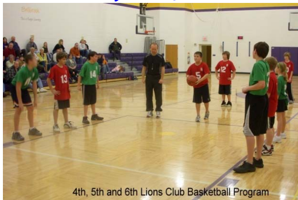
4th, 5th and 6th Lions Club Basketball Program